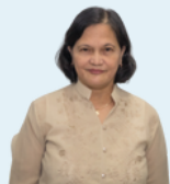
NIDA SC. SALVIO Library Staff