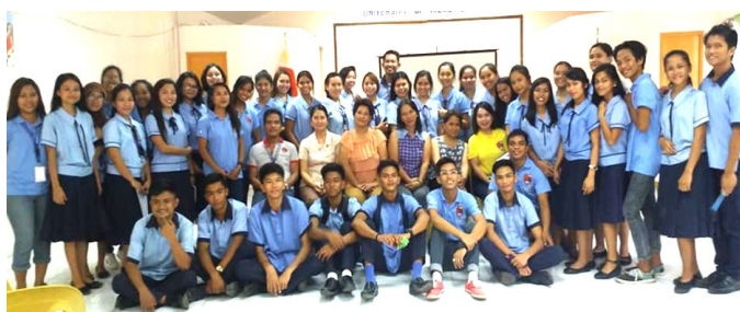
Participants from College of Social Science poses after the workshop

The Pinoy Reading Buddies, Inc. is a non-profit organization that aims to get Filipino children collaborate with their peers and to effectively communicate their ideas about their environment and community. Students should aspire to use their education to improve their communities and eventually, change their world! Pinoy Reading Buddies (PRB) collaborates with teachers to develop teaching methodologies that turn students into agents of change in their communities, using literacy and science as effective problem-solving tools. It offers strategies to teach reading and writing where students are engaged and are creative participants, instead of just listening passively or waiting quietly in the classroom.