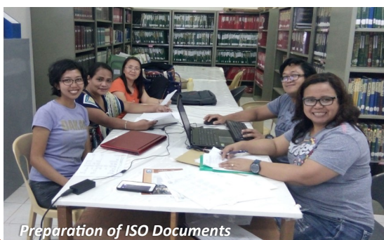
Preparation of ISO Documents