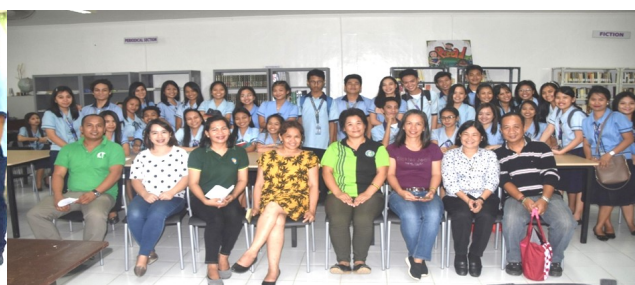
Participants from College of Education poses after the workshop