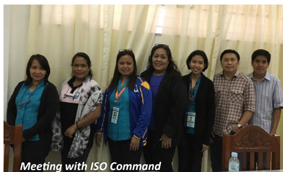
Meeting with ISO Command