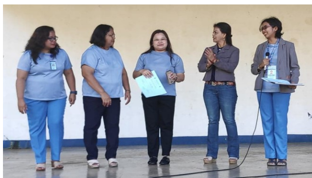
College of Agribusiness and Management as the College with the Most Number of Students Frequently Visiting the DOST-STARBOOKS