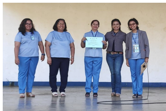
College of Agribusiness and Management with the Most Number of Students Frequently Using the DOST-STARBOOKS