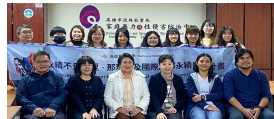
COLLABORATION. URS delegates take time to do academic and cultural exchange with faculty from KMU.

Building on a Memorandum of Understanding (MOU) signed between Kaohsiung Medical University (KMU) and the University of Rizal System (URS), a delegation from URS participated in an enriching International Academic Exchange Workshop hosted by KMU from February 10-14, 2025. This MOU serves as a foundational agreement to foster academic collaboration and deepen mutual partnerships between the two universities, focusing on cross-institutional and cross-sector resource integration.