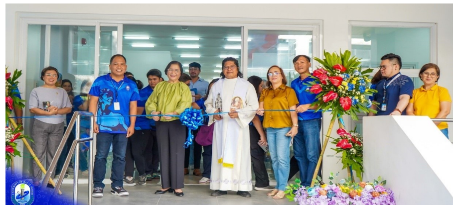
HEALTH & WELLNESS. The new center will provide various health-related services and programs.

The University of Rizal System (URS) marked a significant step forward in its commitment to the health and well-being of its students, faculty, and staff with the inauguration of its new Health and Wellness Center. The event, held on March 6, was celebrated with a ribbon-cutting ceremony followed by a solemn blessing.