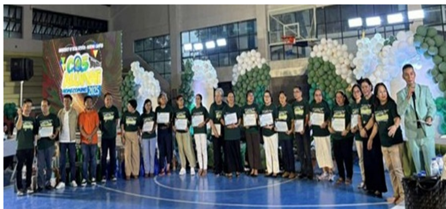
College of Science alumni and faculty celebrate their first-ever URSM homecoming.

The First College of Science (COS) Alumni Homecoming of the University of Rizal System (URS) - Morong Campus was a resounding success, drawing former students back to their roots on August 24.