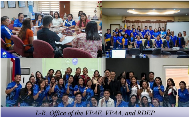
L-R. Office of the VPAF, VPAA, and RDEP