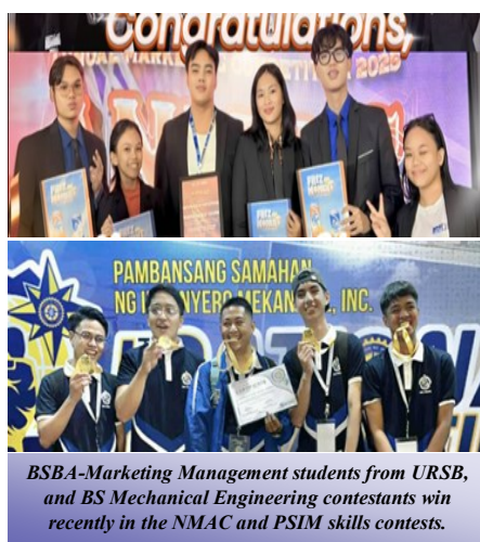
BSBA-Marketing Management students from URSB, and BS Mechanical Engineering contestants win recently in the NMAC and PSIM skills contests.

Five (5) Mechanical Engineering students from URS-Morong (URSM) emerged champions in the Pambansang Samahan ng mga Inhinyero Mekanikal (PSIM) National Mechanical Engineering Students' Conference 2025 skills competition, while 5 other Marketing Management students from URS-Binangonan (URSB) secured the top 10 honors at the Philippine Junior Marketing Association (PJMA)'s Annual National Marketing Competition (ANMC).