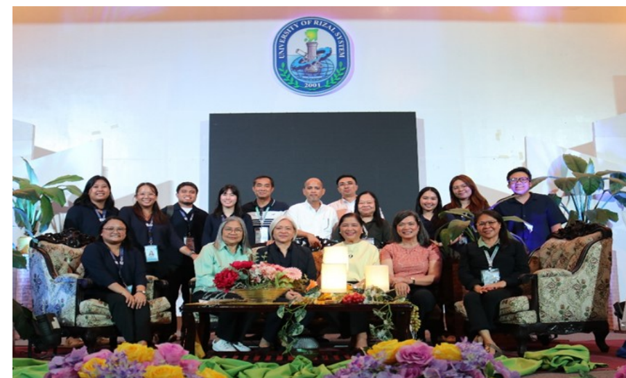
REGIONAL COLLABORATION. Participants to the CALABARZON - Rizal RDP talk on the agenda for the region's growth over the next five years.

The University of Rizal System (URS) Morong Campus co-hosted the CALABARZON Regional Development Plan (RDP) 2023-2028 Rizal Provincial Roadshow at the Eulogio "Amang" Rodriguez Tanghalang Sining (EARTS) on May 29.