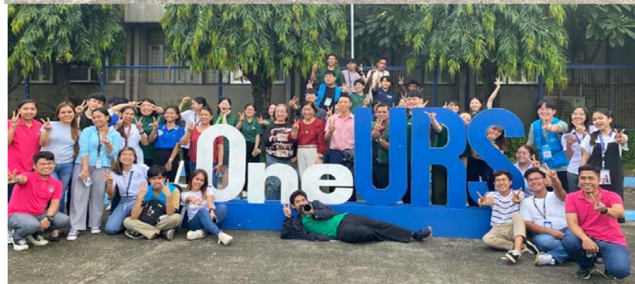
YOUTH FOR PEACE. URS and Korean students celebrate International Youth Day at URS for interdisciplinary and multi-stakeholder collaboration.