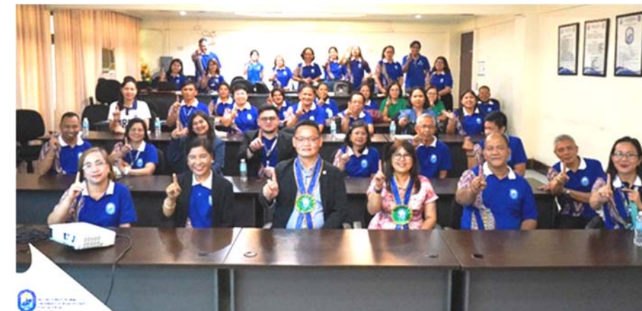
COLLABORATION. Delegates from Kaohsiung Medical U, UPLB, and URS pose for a souvenir.

Delegates from Kaohsiung Medical University (KMU) and the University of the Philippines Los Baños visited URS on September 17.