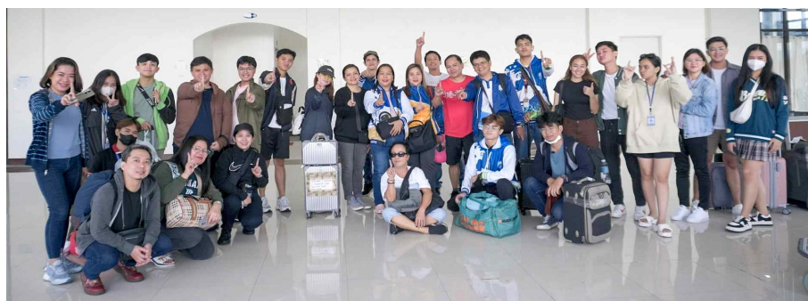
STRASUC Fest. URS wins in the recently concluded culture and arts festival.

This year's theme is "Pag-usahon para sa Sining: A Celebration of Multiculturalism." // JFa