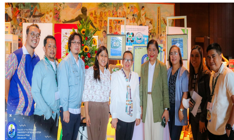
URS@RIIW. Delegates to the First STAARRDEC Regional Research Innovation Week pose for a souvenir.

The oath-taking ceremony took place after the election to solidify their position as the AY 2023 - 2024 URSSF Officers.