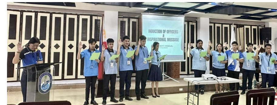
URSSF. Elected officers of the URS Student Federation (URSSF) take their oath.