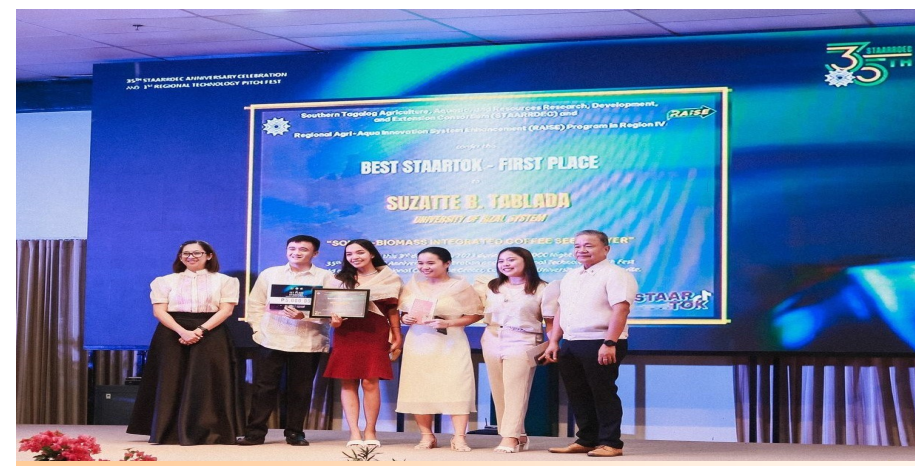
RESEARCH TIKTOKERS. Engineering students show off their awards during the 35th STAARRDEC celebration.