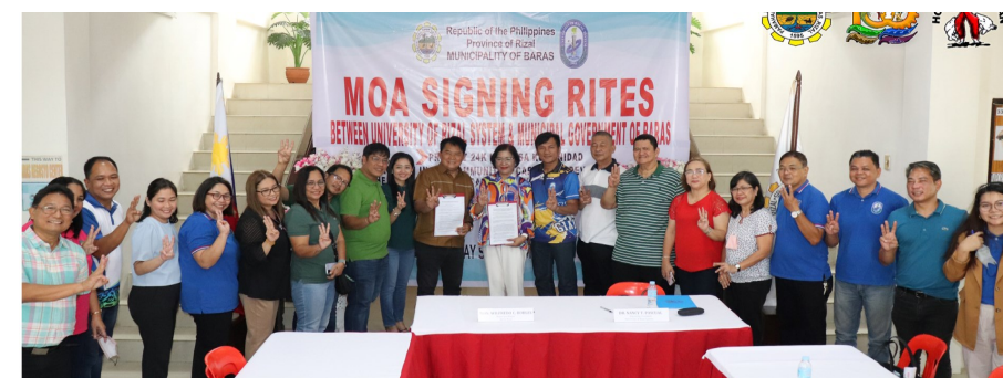
MOA SIGNING RITES BETWEEN URS AND LGU-BARAS, RIZAL MARCH 9, 2023 / MUNICIPAL LOBBY

The University of Rizal System (URS), having been designated as the host institution of the CALABARZON Gender and Development (GAD) Resource Center for 16 years, has entered into a Memorandum of Agreement (MOA) with the Municipality of Baras, Rizal relative to strengthening and implementing GAD-related programs, training, and capability-building activities.