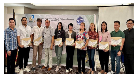
PEERS. Attendees receive their certificates of participation.

Eight faculty members attended the Training Workshop on Trends in Peer Review of Scientific Publications at the MetroCentre Hotel & Convention Center, Tagbilaran City, Bohol on March 22-24. The event was sponsored by the International Association of Scholarly Publishers, Editors, and Reviewers (IASPER).