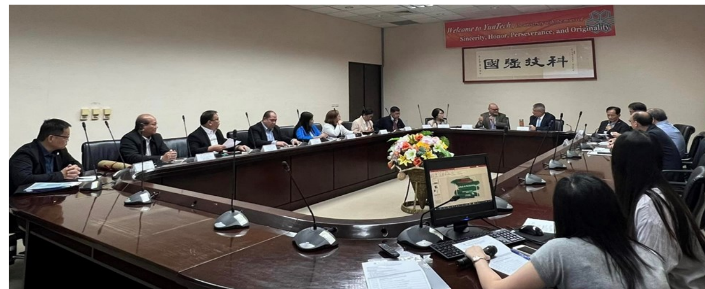
PARTNERS. URS delegates convene with PAASE officers and ECSAAK representing Taiwan-based colleges and universities for possible academic and research collaborations.

The Philippine-American Academy of Science and Engineering (PAASE) in partnership with the Edu-Connect Southeast Asia Association (ECSAAK) held the visit-cum-conference called the PH-TW Bayanihan Linkages through (Science, Technology, Engineering, Arts, Agriculture, Mathematics, and Medicine) STEAAMM with the theme "Building Partnerships for Inclusive Education, Science, and Technology" on May 7-11 in Kaohsiung City, Taiwan.