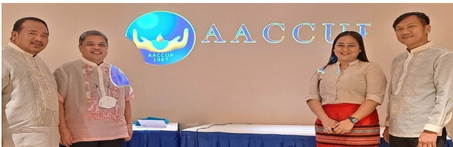
ACCREDITATION. Representatives to the 36th AACCUP conference pose for a souvenir.

The University of Rizal System representatives attended the 36 th Association of Accrediting Agency of Chartered Colleges and Universities (AACCUP) Annual Conference and General Assembly on March 27-29 at Century Park Hotel, Malate, Manila.