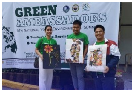
GREEN Ambassadors. URS contingent attends the 35th NYE summit in Baguio City.

The Green Alliance Philippines brought together 600 Green Ambassadors as registered participants from institutions and local government units nationwide, including the University of Rizal System (URS) at the 5th National Youth Environmental Summit at Teacher's Camp Baguio City, March 1-4.