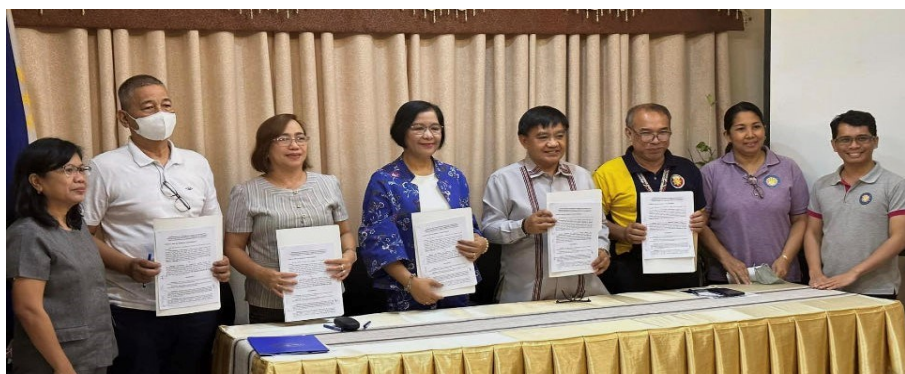
INDIGENOUS. URS and NCIP enter into a MOA in the service of our indigenous people.

Through a Memorandum of Agreement, the University of Rizal System and the National Commission on Indigenous People Region IV-A (NCIP RIV-A) formed a formal partnership to deliver various capability-building extension projects for the indigenous people of Rizal. The signing was held at the Audio-visual Education Center, URS Morong Campus on April 4.