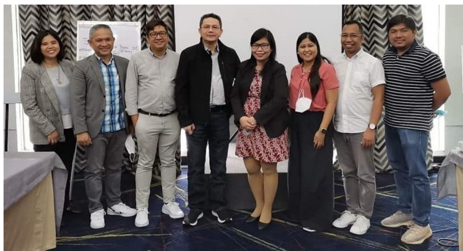
CONTINUITY. The URS contingent successfully defended its BCP and IT Continuity Plan before the CHED, DLSU and PNU experts.

The University of Rizal System (URS) through the University Planning, Monitoring and Evaluation Office (UPMEO) team successfully defended its Business Continuity Plan (BCP) and ICT Continuity Plan (ICT CP) before a panel composed of experts from the Commission on Higher Education, De La Salle University-Manila, De La Salle-College of Saint Benilde, University of the Philippines and National University, on Nov. 8-10.