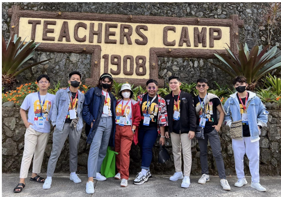
OUR HOPE. Youth delegates from the University showcase their talents in the 60th National Rizal Youth Leadership Institute held in Baguio City in December.

The Knights of Rizal (KoR) conducted its 60th National Rizal Youth Leadership Institute (NRYLI) with the theme, Rizal in Dapitan: Systems Thinking in Action, from December 14 to 17 at the Baguio Teachers Camp, Baguio City.