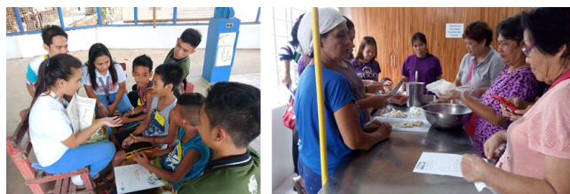
URSAC's Flexible Learning Assistance Program (FLAP)