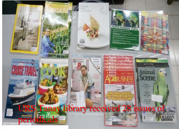
URS Tanay library received 28 issues of periodicals