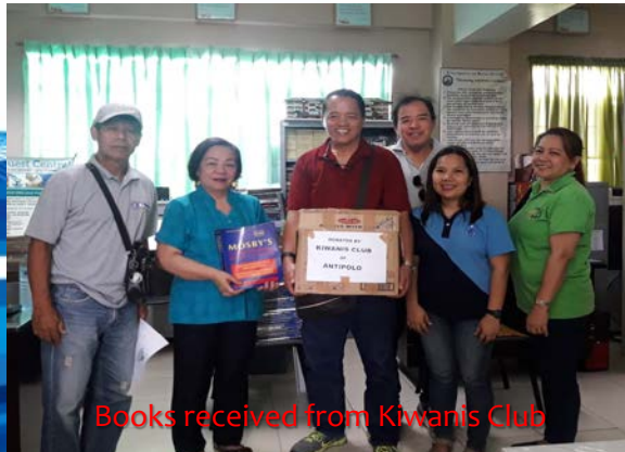
Books received from Kiwanis Club