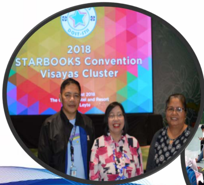
STARBOOKS Convention 2018 held last August 3, 2018, in Oriental Hotel, Palo, Leyte.

PLAI-STRLC: Explore Malaysia and Experience Thailand's ABC, held at Bangkok Thailand and Kuala Lumpur Malaysia on August 23 to 26, 2018.