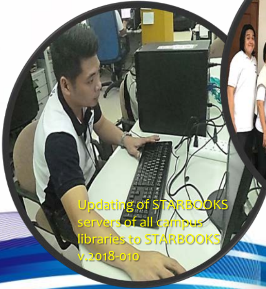
Updating of STARBOOKS servers of all campus libraries to STARBOOKS v.2018-010