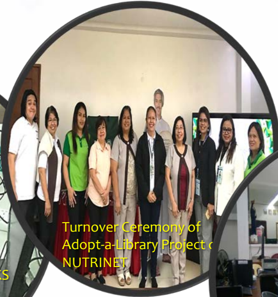
Turnover Ceremony of Adopt-a-Library Project of NUTRINET