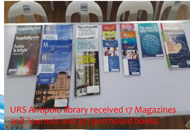
URS Antipolo library received 17 Magazines and Journals and 351 purchased books.