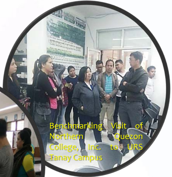
Benchmarking Visit of Northern Quezon College, Inc. to URS Tanay Campus