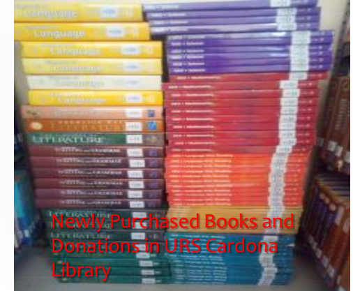
Newly Purchased Books and Donations in URS Cardona Library