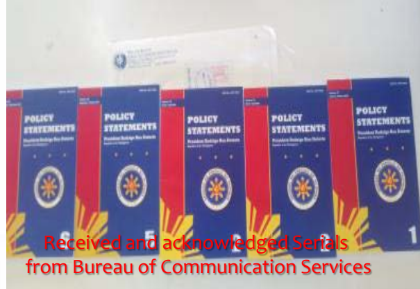
Received and acknowledged Serials from Bureau of Communication Services