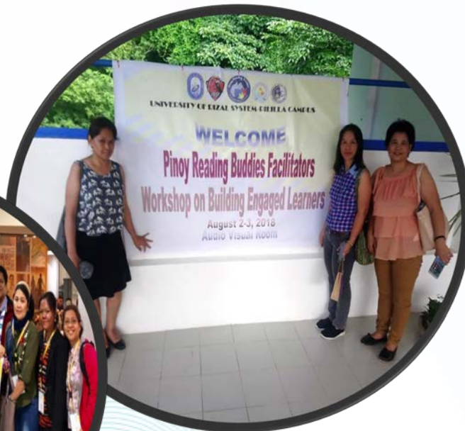
Workshop on Building Engaged Learners held at Audio Visual Room URS Pililla Campus on August 2-3, 2018