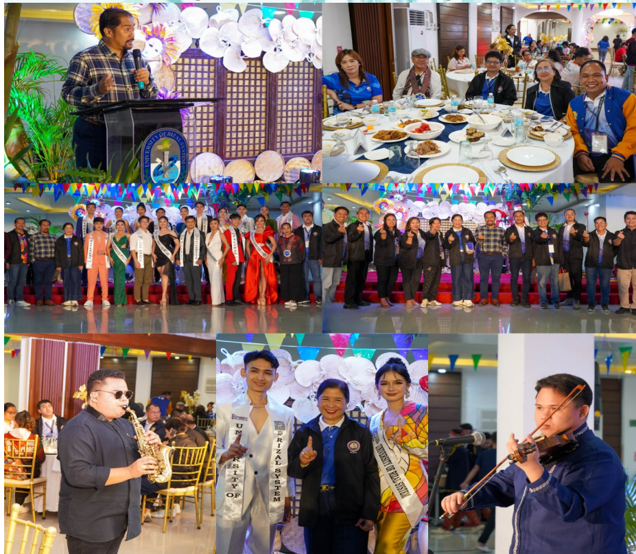
SHAPING THE FUTURE TOGETHER. Rizal Province dignitaries and SUC presidents gather to celebrate culture and arts dynamism.

A night of elegance and celebration unfolded on November 26 as the Governor's, Mayors', and Presidents' Night took center stage during the Southern Tagalog Regional Association of State Universities and Colleges Culture and the Arts Festival. Held at the Thriftmart Events Place at 7:00 pm, the event honored leadership and cultural contributions while showcasing artistic talents across the region.