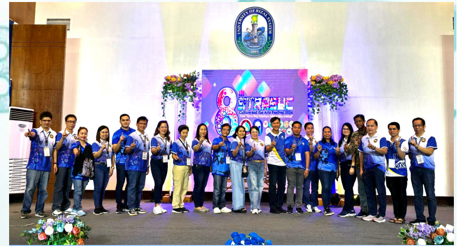
UNITED. SCAF contest headmasters and chairs pose for a souvenir photo.